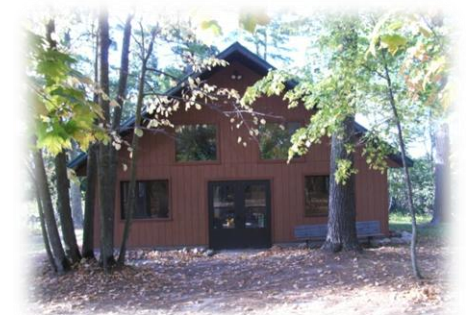
Pine Point Chapel

NOTES: Please provide your own bedding in all accommodations. Check out by 2 PM (unless prior arrangements are made). Guests perform light cleaning of buildings and grounds before leaving. Discounted meal plans are available to groups with kids.